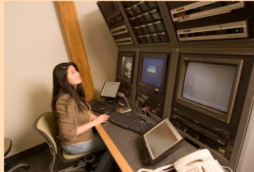
The audio/visual recording room