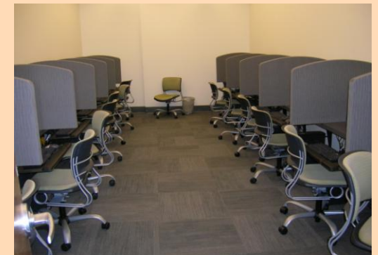
A group testing space in the Lab

Please go to www.ssri.duke.edu/diisp-lab.php to register as a researcher, apply for grants, and learn more about the equipment and facilities we have to support social science at Duke.